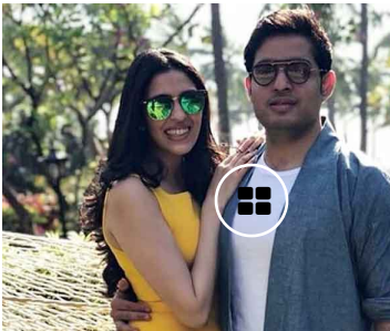
In-pics-meet-shloka-mehta-the-fiancee-of-mukesh-ambanis-son-akash ( https://www.inuth.com/photos/celeb-photos/in-pics-meet-shloka-mehta-the-fiancee-of-mukesh-ambanis-son-akash/ )