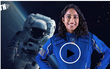
Meet the second Indian-origin woman flying to space ( https://www.inuth.com/india/meet-the-second-indian-origin-woman-flying-to-space/ )