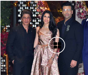
Akash Ambani-Shloka Mehta engagement bash ( https://www.inuth.com/photos/celeb-photos/akash-ambani-shloka-mehta-engagement-bash/ )